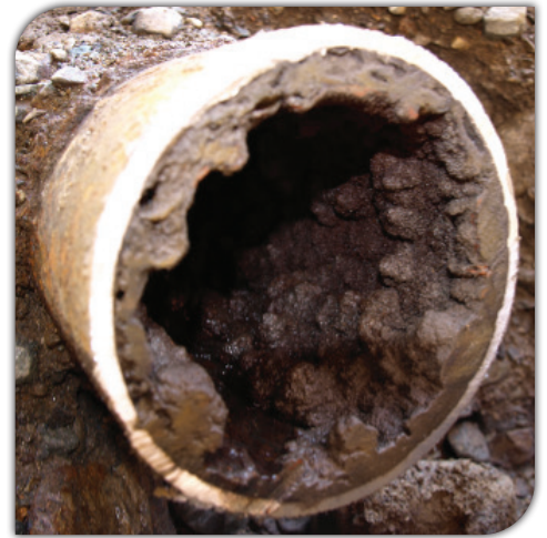
Corroded iron water main

Replacing the City's water mains will improve water pressure, fire flow rates, and overall system reliability. Our water distribution system is at its useful life and investing in our water infrastructure will ensure that we have reliable water service for the next 100 years. If we do not address this issue, it will only increase the cost to repair and replace our water infrastructure on an emergency basis in the future after it begins to fail.