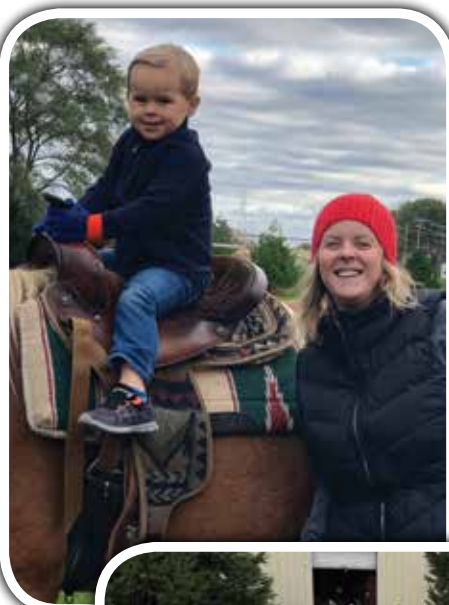
Halloween Hayride, 2018