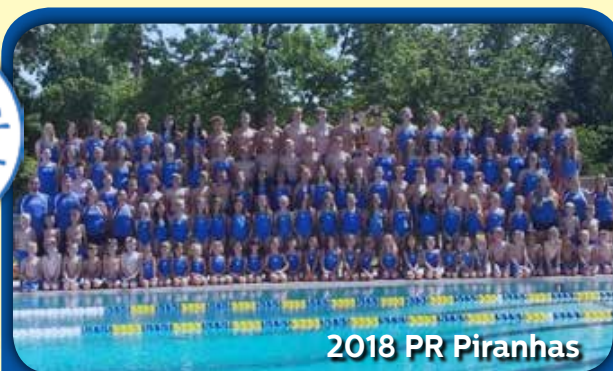
2018 PR Piranhas