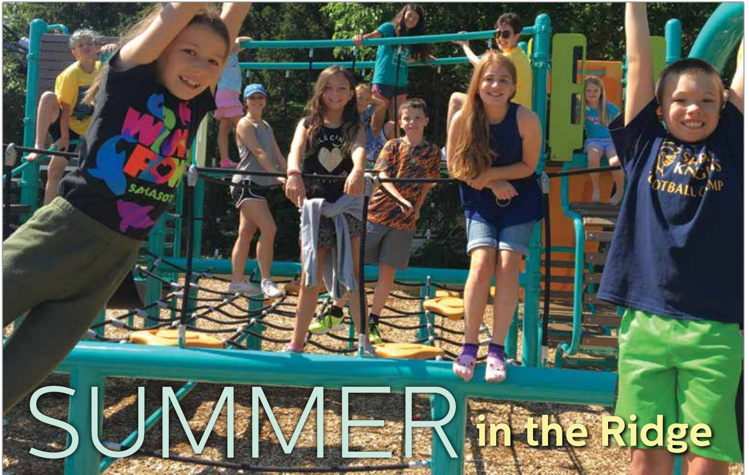
2018 Summer Camp Program.

NEWS & EVENTS • CITY OF PLEASANT RIDGE, MICHIGAN • JUL.-SEP., 2018