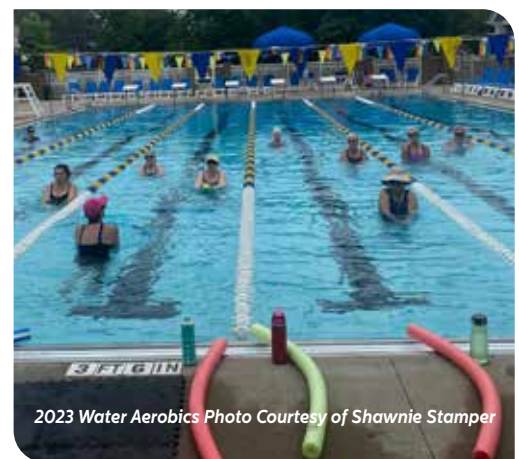
2023 Water Aerobics

Students are asked to bring 2 "sturdy" noodles.