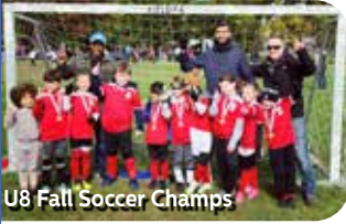
U8 Fall Soccer Champs