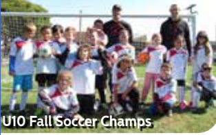
U10 Fall Soccer Champs

This program services leagues U4, U6, U8, U10, and U12. Practices at Gainsboro Park, games in Ferndale. Players will need to supply their own cleats, shin guards, shorts, and water bottles. Jersey and matching socks will be provided.