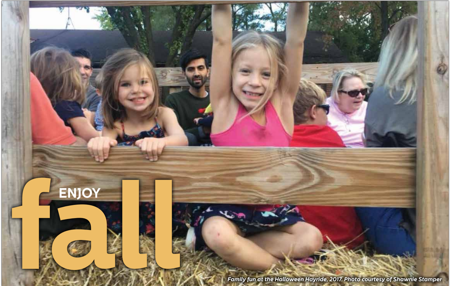
Family fun at the Halloween Hayride, 2017.

NEWS & EVENTS • CITY OF PLEASANT RIDGE, MICHIGAN • OCT.-DEC., 2018