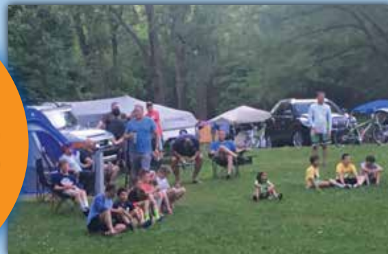
Fun times at the PR Father's Day Camp Out, June 2017