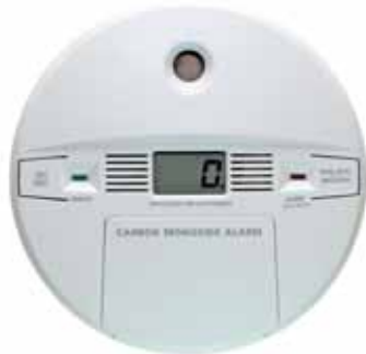
Carbon monoxide detector