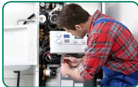
Have your heating system serviced annually